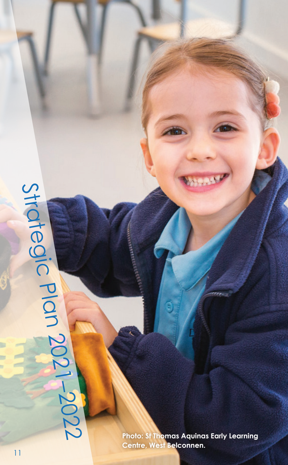
Photo: St Thomas Aquinas Early Learning Centre, West Belconnen.