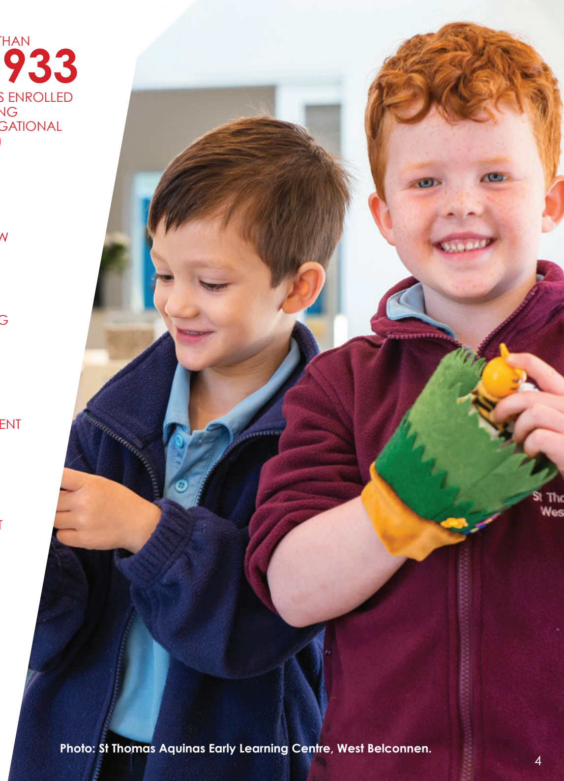
Photo: St Thomas Aquinas Early Learning Centre, West Belconnen.