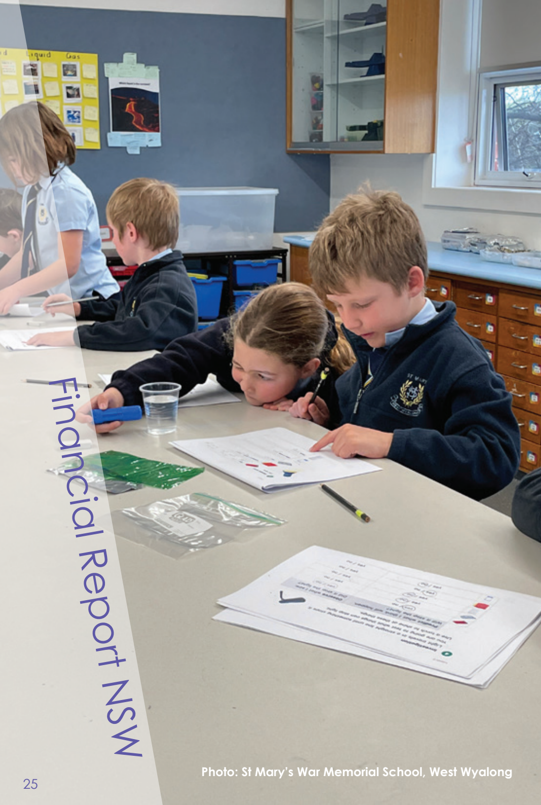
Photo: St Mary's War Memorial School, West Wyalong