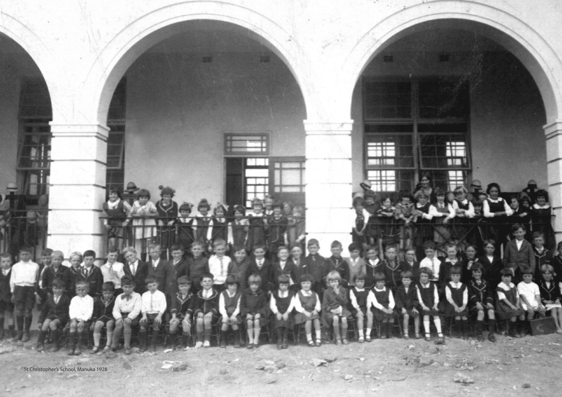
St Christopher's School, Manuka 1928