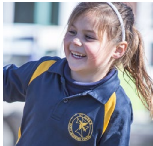
Photos (L-R) St Jude's Early Learning Centre, Holder ACT. Mother Teresa Early Learning Centre Harrison ACT